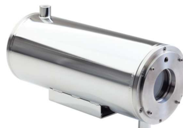
129LC LIQUID COOLED CAMERA HOUSING

AISI316L STAINLESS STEEL CONSTRUCTION FOR USE IN HIGHLY CORROSIVE ENVIRONMENTS EASY INSTALLATION AND MAINTENANCE LIQUID COOLING SYSTEM WEATHERPROOF STANDARD IP66/IP67 SUITABLE FOR ANALOG AND IP CAMERAS DAY/NIGHT AND IR THERMAL VERSIONS AVAILABLE REFINED AND MODERN DESIGN