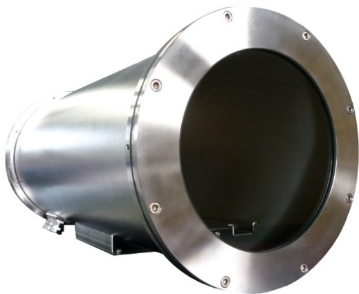
■ 254 Stainless steel camera housing