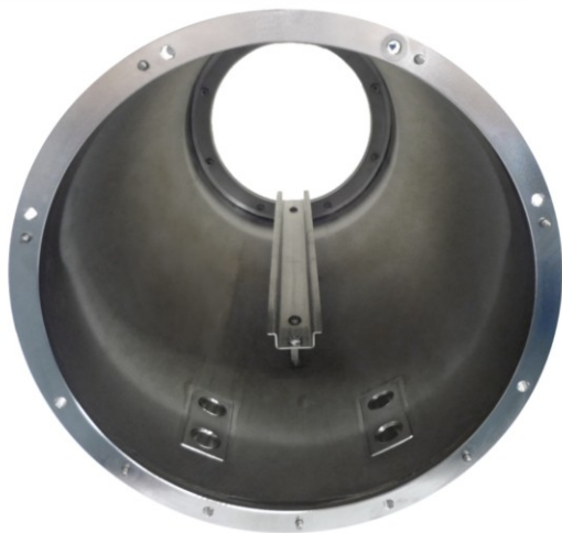
■ 254 Internal view

The housing is entirely made in AISI316L stainless steel, therefore it guarantee absolute reliability and protection in every environmental condition, even the worst. The stainless steel bracket is conceived to reduce vibrations and to keep the housing still in most windy places and for those special applications that require the absence of any vibrations. Install and maintenance tasks are really easy and the price is affordable.