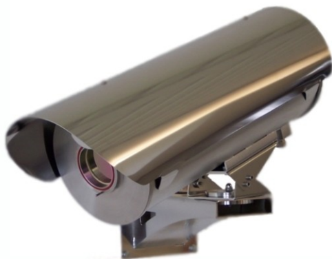
■ 204SHIR Custom + SSBK204 Housing for IR viewings and wall mount bracket; custom made model with front window shutter