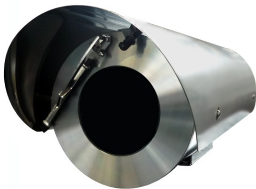
■ 204WW120 Housing with sunshield, heater and wash wiper

AISI316L Stainless Steel construction For use in highly corrosive environments Easy installation and maintenance Wiper and washer version available Weatherproof standard IP67 Refined and modern design